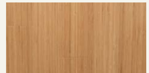
Carbonized Vertical 3' NEWCV960 • Solid • Size: 5/8" x 3 3/4" x 37 3/4"