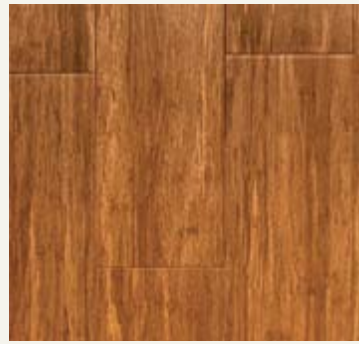
Carbonized Strand Uniclic CARBCLK-ES4 • Engineered Size: 9/16" x 4" x Random Length to 47 5/8"