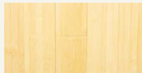
Natural Horizontal 3' NEWNH960 • Solid • Size: 5/8" x 3 3/4" x 37 3/4"