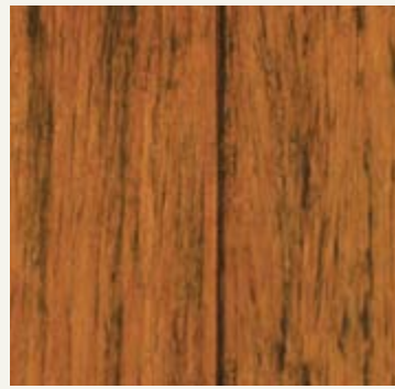
Carbonized Hand Scraped CARHS-ES4 • 4 sided Micro-Beveled T & G Engineered Size: 9/16" x 4" x Random Length to 48.03"