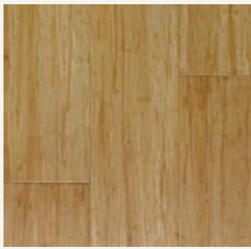
Natural Strand NAT-ES4 • 4 sided Micro-Beveled T & G Engineered Size: 9/16" x 4" x Random Length to 48.03"