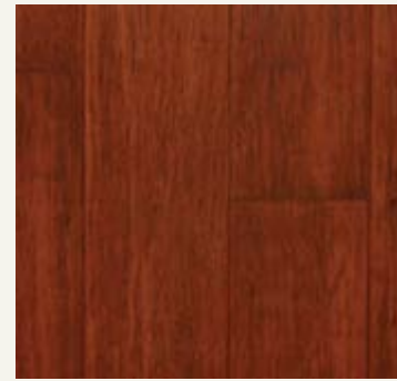
Santos Mahogany SANT-ES4 • 4 sided Micro-Beveled T & G Engineered Size: 9/16" x 4" x Random Length to 48.03"