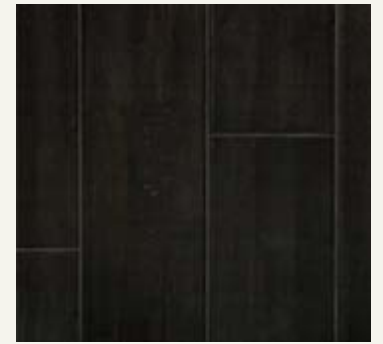
Ebony Distressed (chatter) EBOHS-ES4 • 4 sided Micro-Beveled T & G Engineered Size: 9/16" x 4" x Random Length to 48.03"