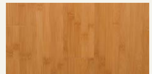
Carbonized Horizontal 3' NEWCH960 • Solid • Size: 5/8" x 3 3/4" x 37 3/4"