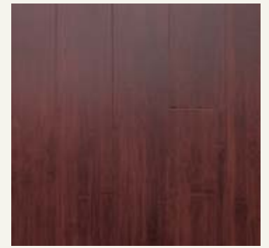
Auburn AUB14T1020 • Traditional Solid T & G Size: 9/16" x 5.08" x 40.16"