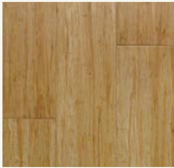
Natural Strand Uniclic NATCLK-ES4 • Engineered Size: 9/16" x 4" x Random Length to 47 5/8"