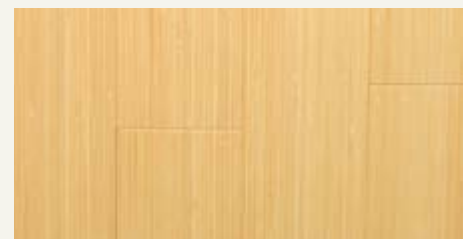
Natural Vertical 3' NEWNV960 • Solid • Size: 5/8" x 3 3/4" x 37 3/4"