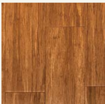
Carbonized Strand CARB-ES4 • 4 sided Micro-Beveled T & G Engineered Size: 9/16" x 4" x Random Length to 48.03"