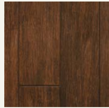
Walnut WAL960 • Traditional Solid T & G Size: 5/8" x 3 3/4" x 37 3/4"